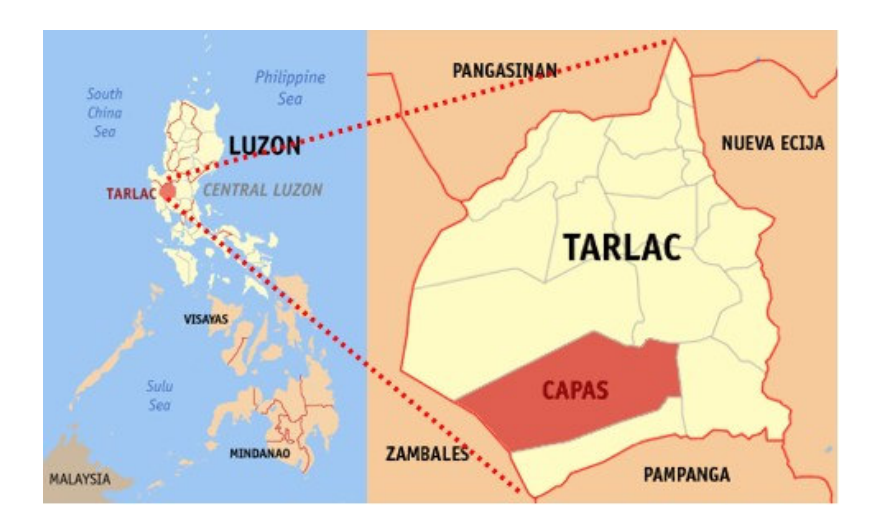
Figure 3 Location Maps<sup>2</sup>

Capas is a 1<sup>st</sup> class municipality in the province of Tarlac, Region III- Central Luzon. The Municipality has a population of 95,219 people divided into 20 barangays on a total of 18,333 households (as of year 2000).